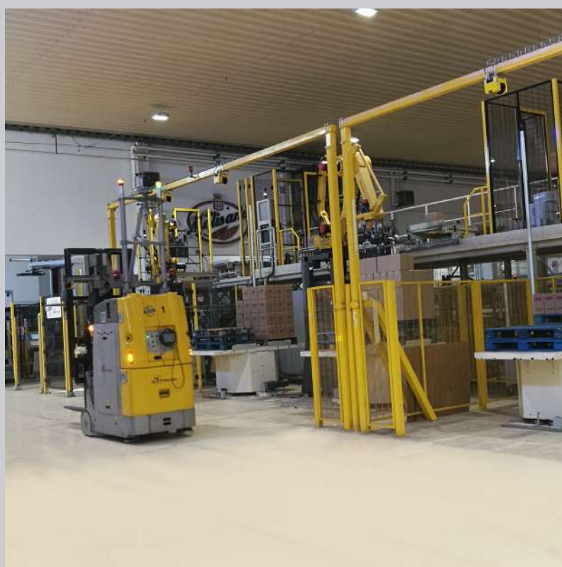
Automated pasta warehouse