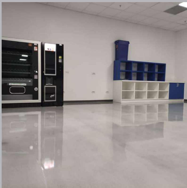
Project: Amazon - Novara