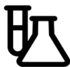
High chemical resistance