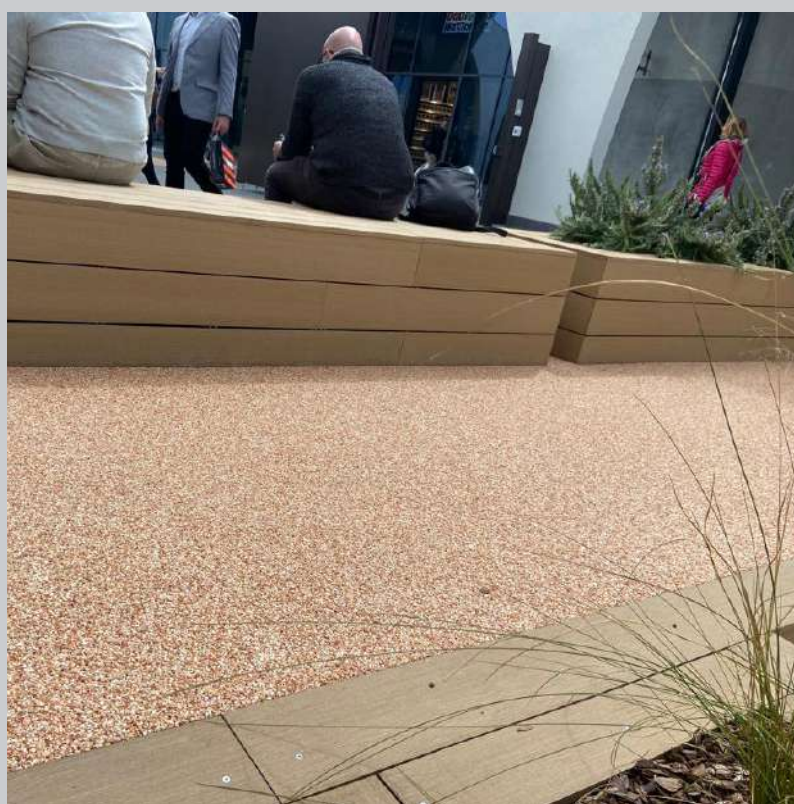
TO DREAM - Urban District