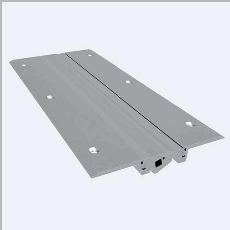
Structural aluminium joint