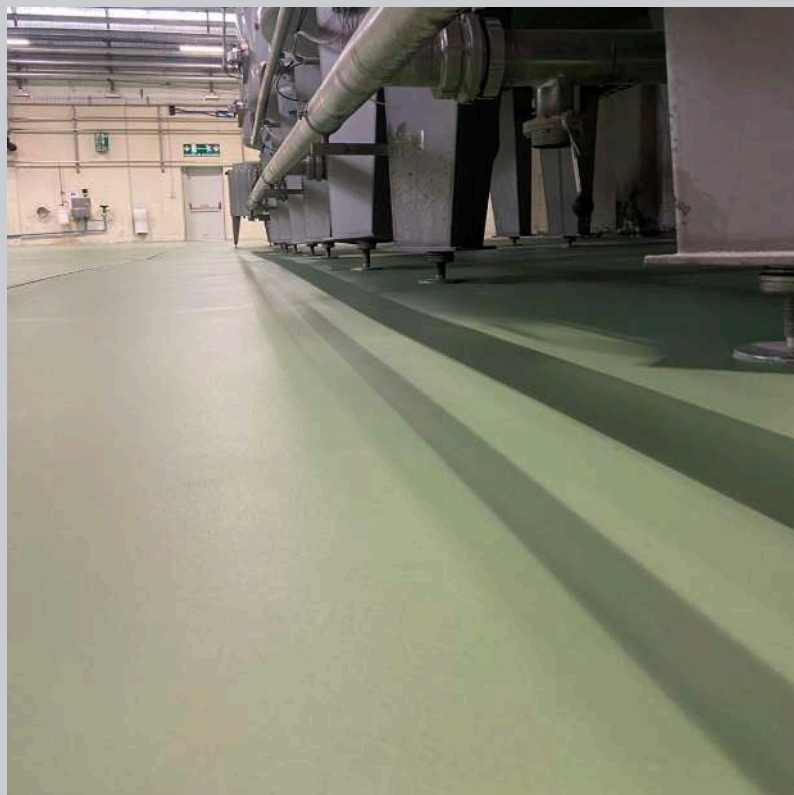
Fruit processing industry