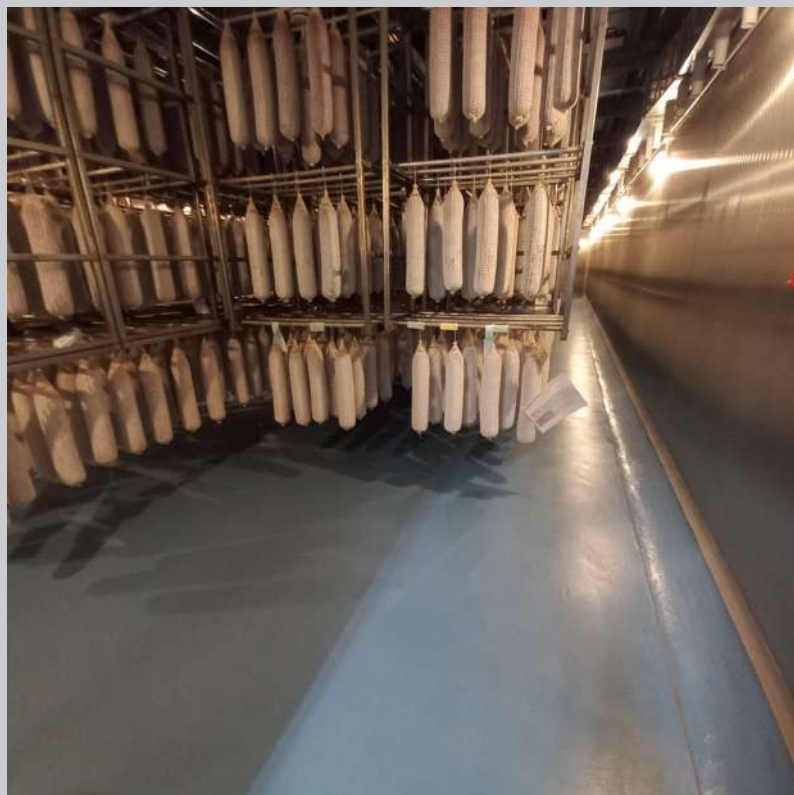
Charcuterie factory warehouse