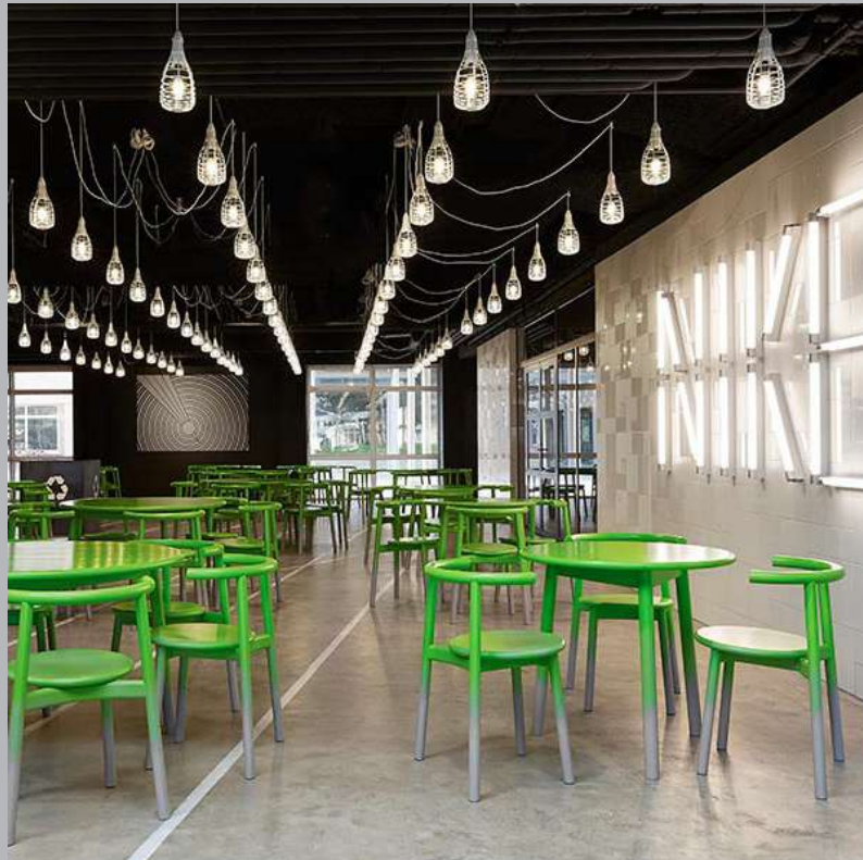
Project: Nike European Headquarters — Hilversum, NL