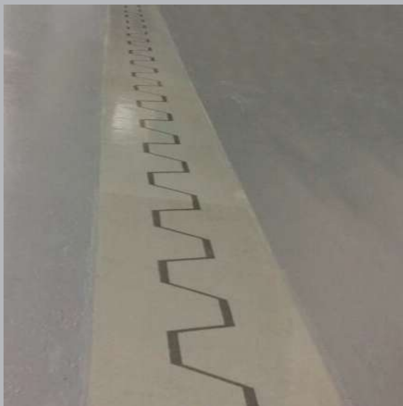
Smart Joint® applied on finished resin floor